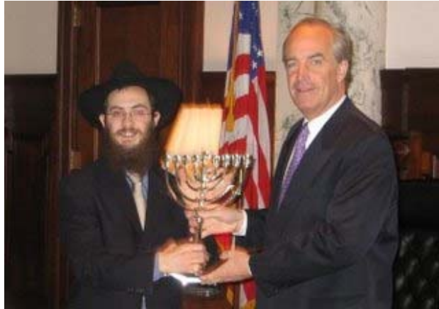
Secretary of the Interior, James E. Risch